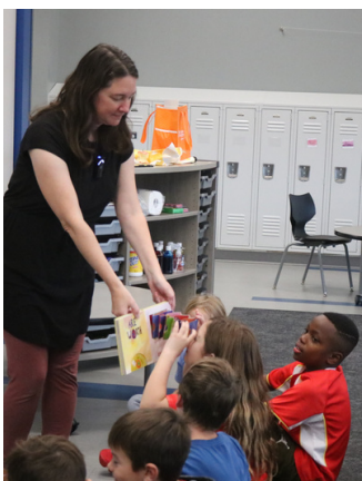
Elk Ridge Elementary