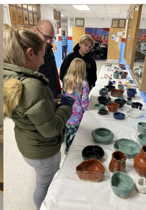
North Sargent Public