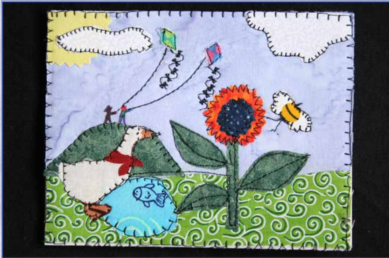
Card with various fabrics stitched directly to and covering the entire face of it. The material is cut and arranged to create a picture. A goose, pond with fish, sunflower, bumblebee, clouds, sun, and a hill with two people flying kites are created all using different-patterned fabric.