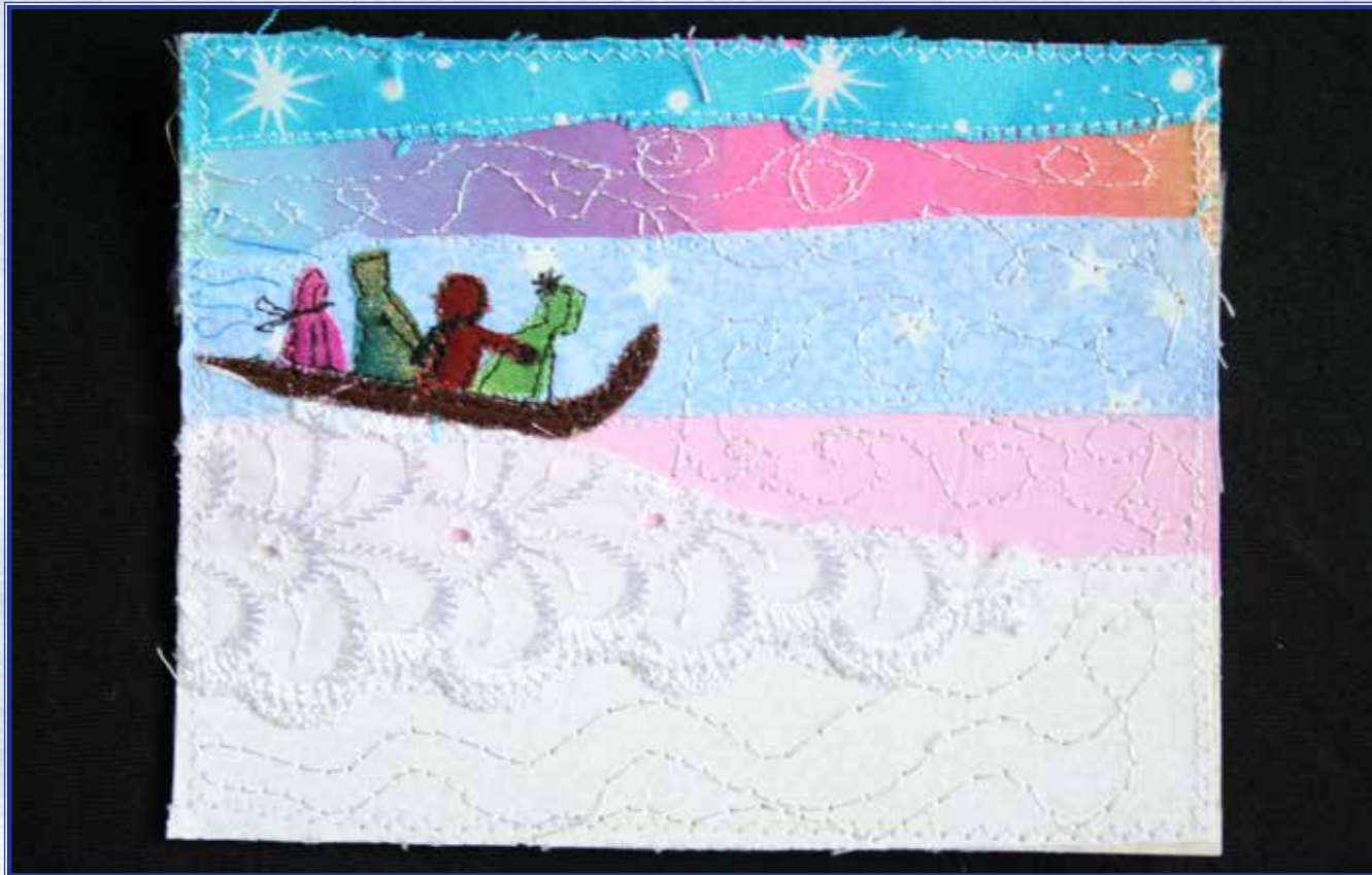
Card depicting a memory of children sliding down a snow hill on a toboggan. Note the irregular-cut, patterned material that is coordinated to reflect a starry winter night. White-embroidered white material adds contrast, texture, and interest for the snow hill. The pink material next to the white material has shiny specks in it, which imitates the shimmering of snow in the starlight. The pieced material does not have to be cut perfectly to achieve a beautiful design. Irregular stitching is applied for interest.