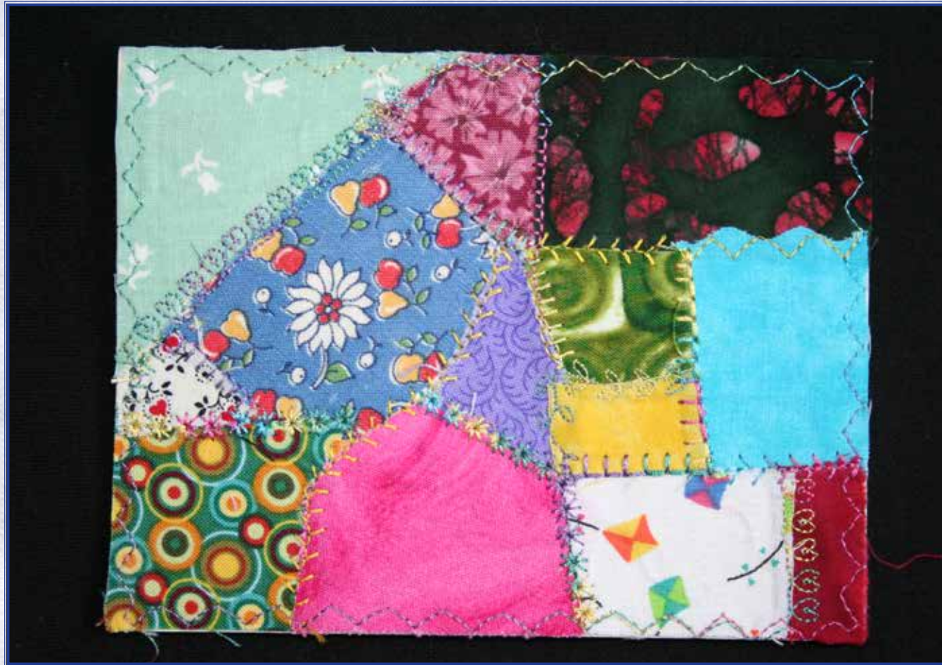
Card, with crazy quilt pattern, that is made by using fabric of various designs and colors stitched to and covering the entire face of it.