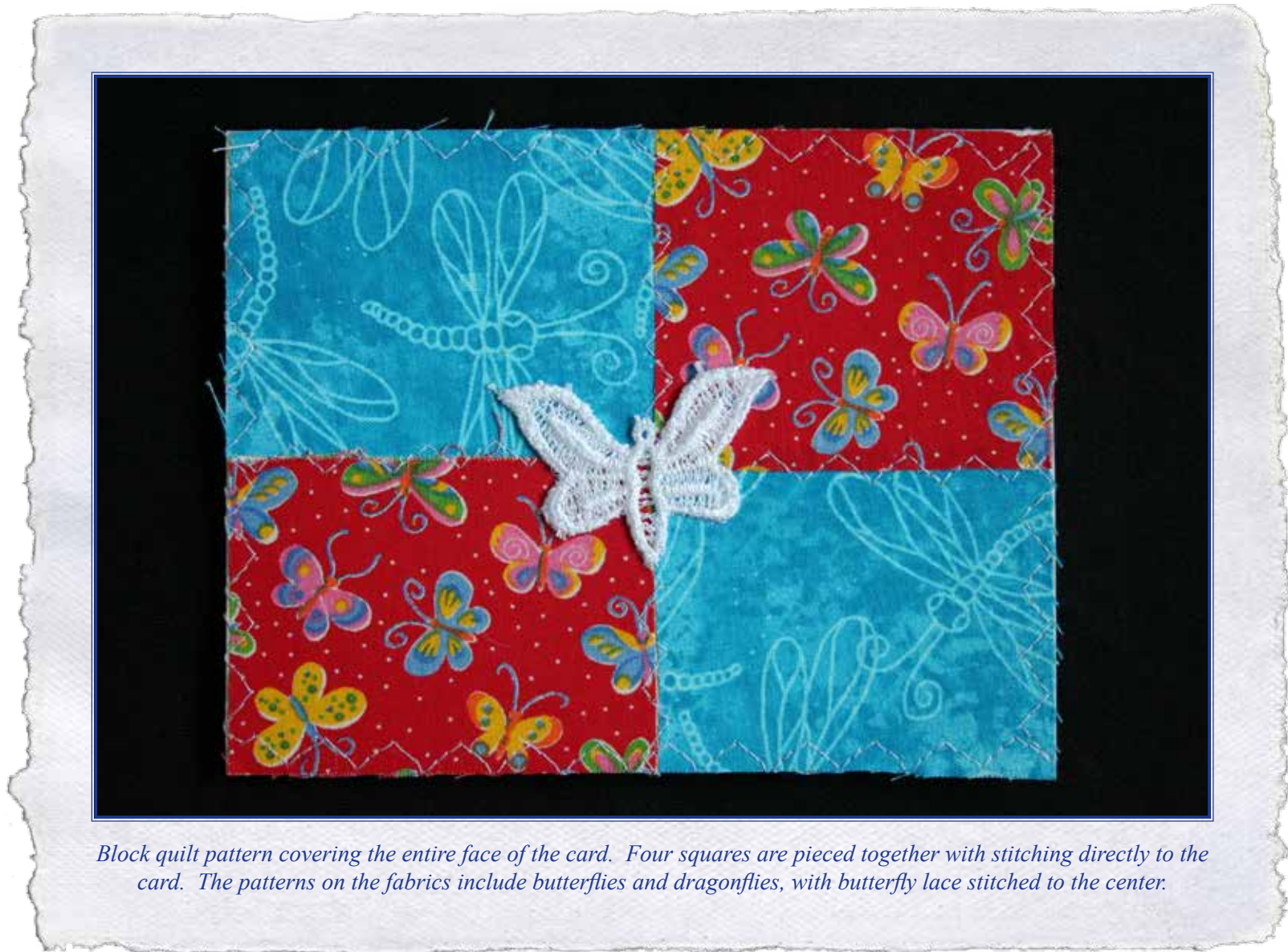
Block quilt pattern covering the entire face of the card. Four squares are pieced together with stitching directly to the card. The patterns on the fabrics include butterflies and dragonflies, with butterfly lace stitched to the center.