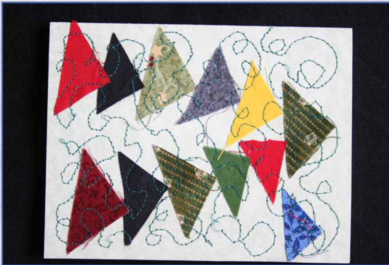
Card with flying geese quilt pattern, which is formed of small, triangular-shaped pieces of cloth stitched to the face of it. Note that the fabric does not cover the entire face of the card.