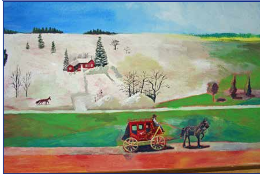
Detail on wall mural.