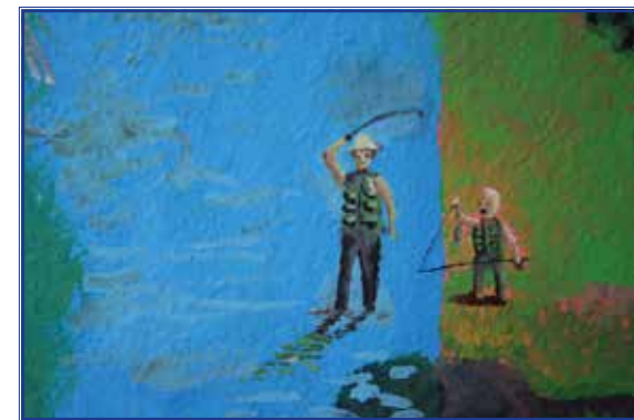
Depiction of an elder resident's memory fishing with his son in the James River.