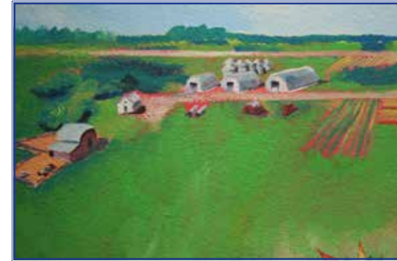
A painting depicting an elder's farm in rural Jamestown, ND.