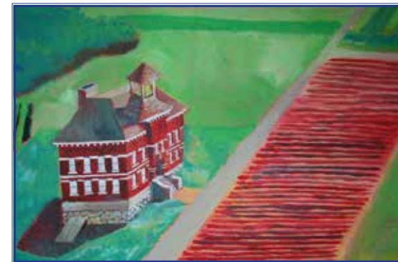
Image depicting the old local school in Jamestown, ND.