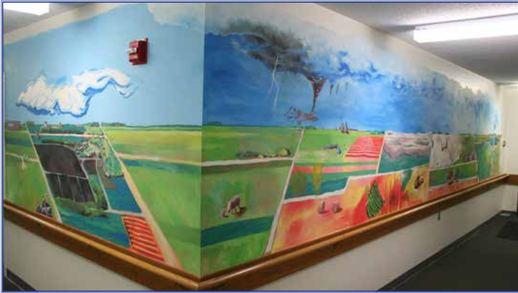
A portion of the 100 foot mural at Ave Maria and the Heritage Centre in Jamestown, ND.